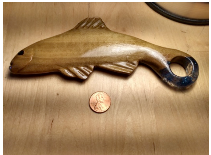
Mateo McCullough carved several small pieces that are not much bigger than a penny. Two cherries on one, rams head on another, a fish carved from poplar and a knife using 1084 steel for the blade with cherry sidepieces.