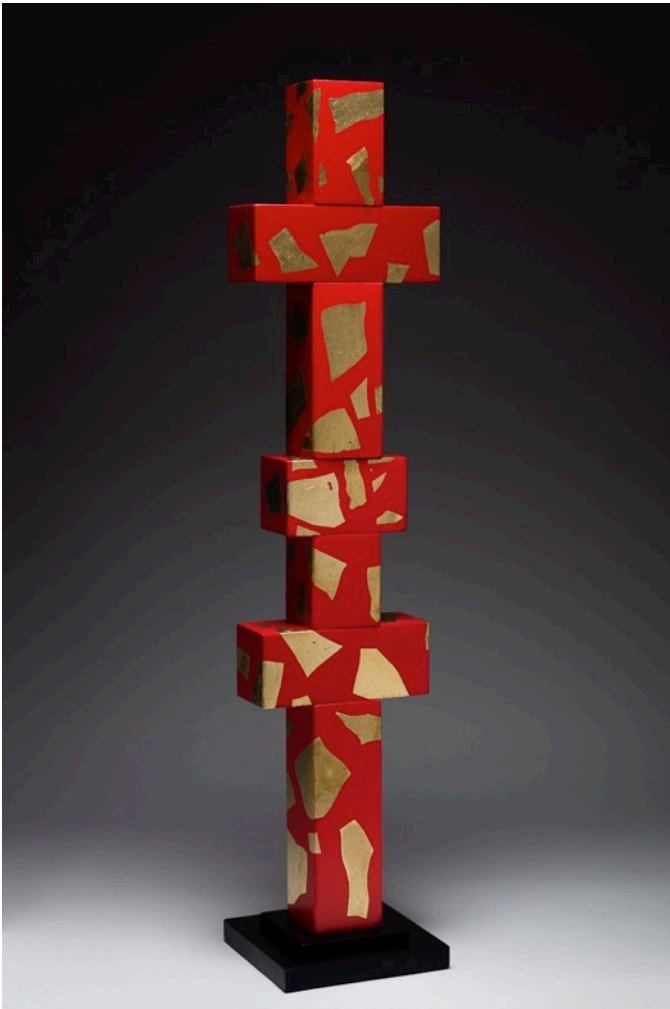
Syd Dunton continues his sculpturing with one he calls "Hong Kong". It stands 60 inches tall and is painted bright red with gold leaf applied in random locations.