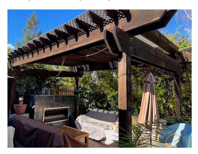
Trellis near Branham High School available