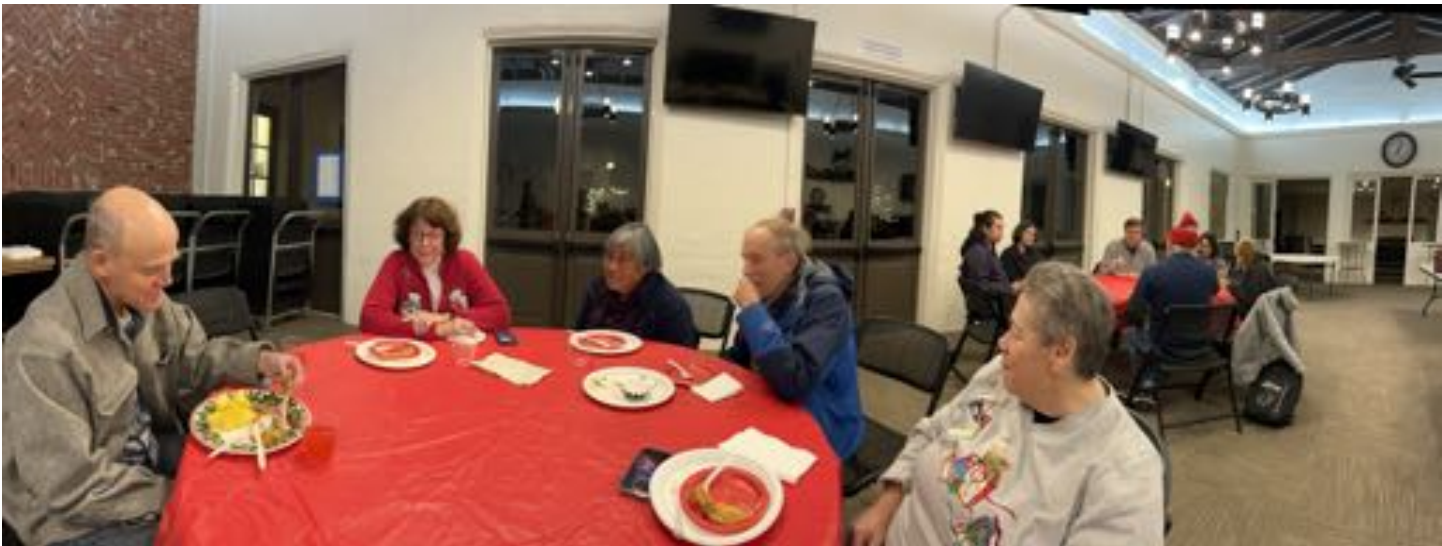
Holiday Christmas Party - from left to right