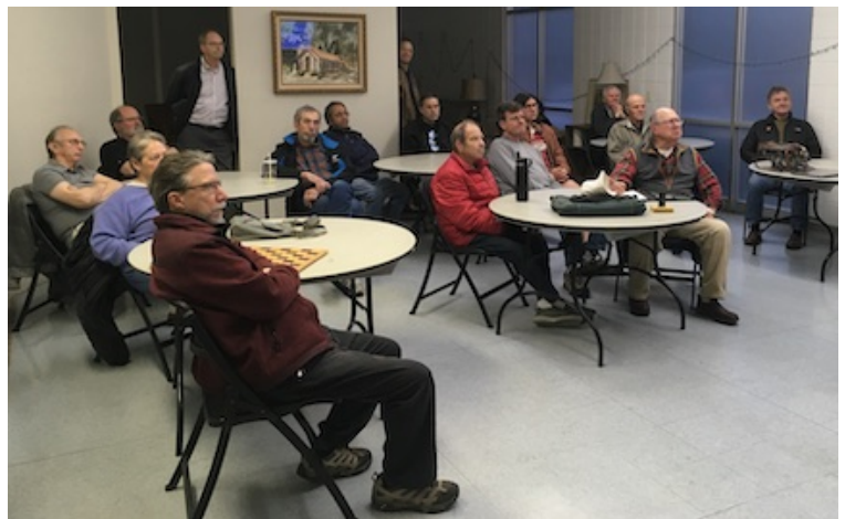
Meeting March 28, 2023