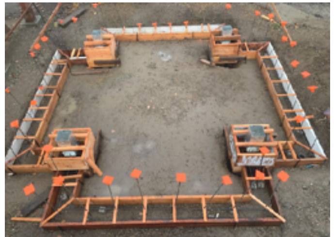
Concrete forms for the green house foundation