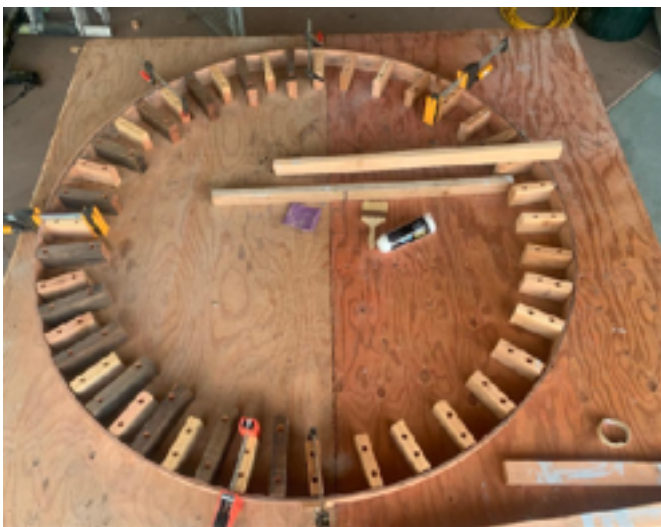
Template for the green house dome