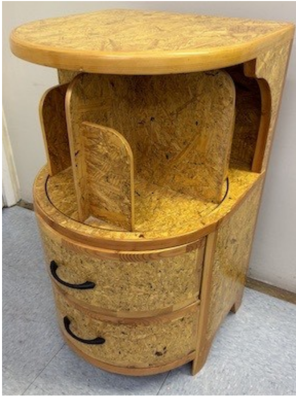
Bob Konigsberg brought in an end table with interesting curves and used OSB Plywood in a decorative way.