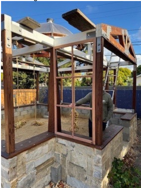
Jim Bender shared updates on building window frames for the green house at Redwood High School.