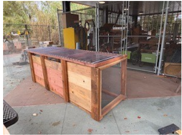
Redwood High School Garbage enclosure