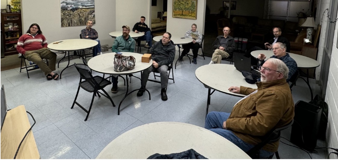
November 26 2024 Meeting