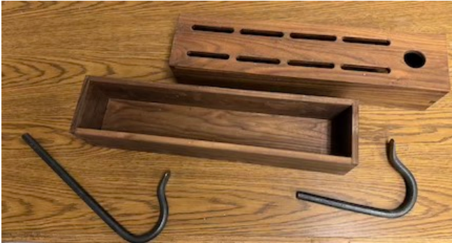
Forged hold-downs and removable/invertible center trays

both for the leg vise and the wagon vise. Some features include a sliding deadman, forged hold-downs, a planing stop, and removable/invertible center trays.