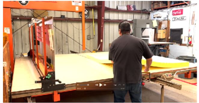
Vertical band saw cutting foam

(She needed new foam for the bedding in her camper before her trip.) Bob's Foam Factory is a great shop that will allow you in the work area to lay down on tables on the foam you are considering.